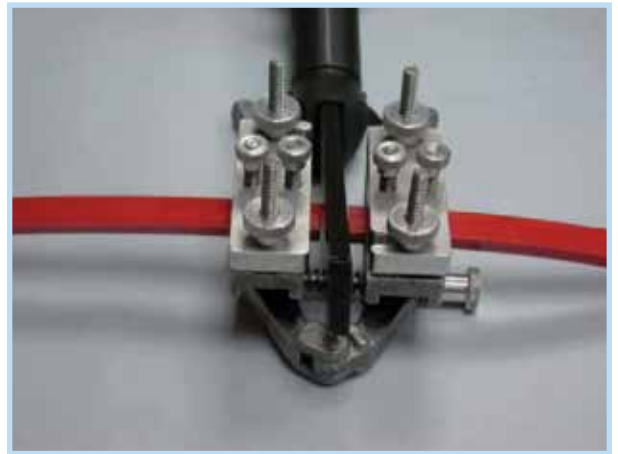
F51 Pliers for larger profiles