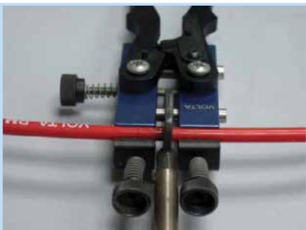
R8 Mini Pliers for smaller profiles