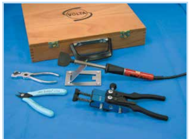
Kit for small profile welding