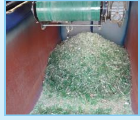
FRPZ-6 Glass recycling