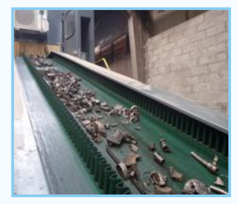
FRZ - 4 Metal recycling