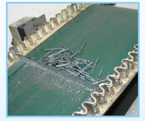
FEZ - 3 Nails production