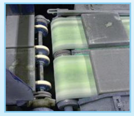
FK - 3 Brick pre - oven conveying