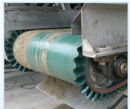
Sewage Treatment Lines