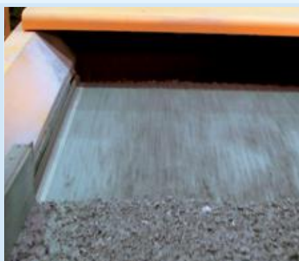
Magnetic Metal Separator