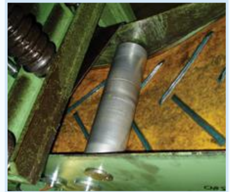
Magnetic Metal Separator