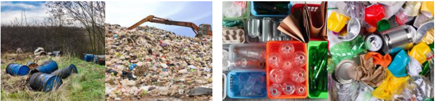
Sorted or Mixed