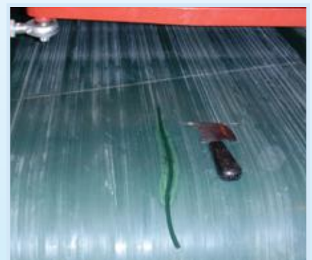
FRPZ-8 belt repaired with electrode