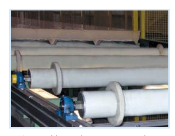
Non-marking surface protects products