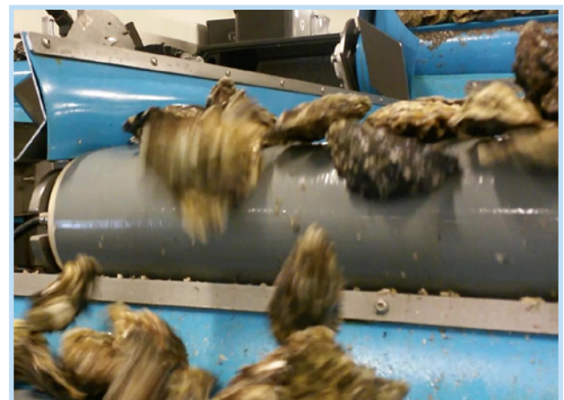
Preventing ingress of sea water and sand during oyster washing