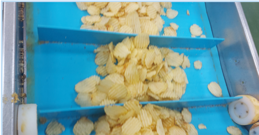
Compare with particles on edges and dirty rollers