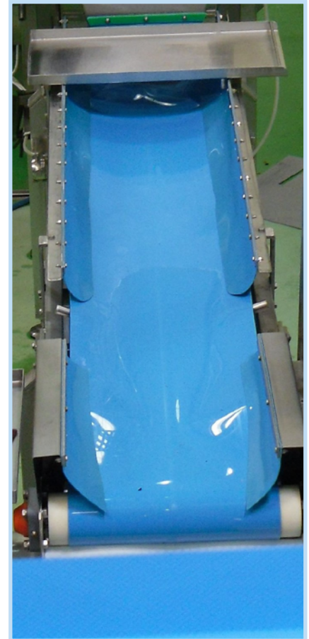
Prevention of damage to bearings and frame – 3% acetic acid pickle on belt - 7 years trouble-free working life