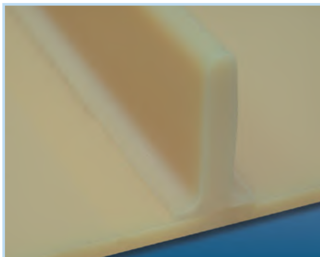
Volta T-cleat welded on Flat belt

For additional information about available cleat dimensions and colors other than those listed in the table, please contact your local Volta distributor.